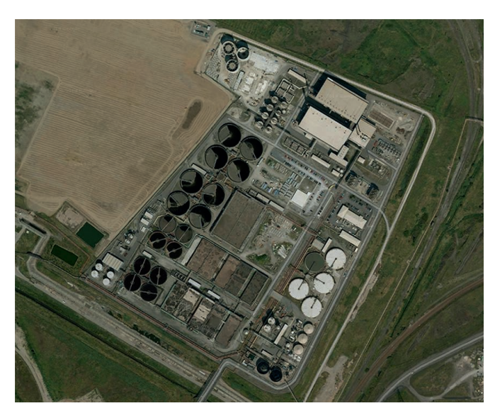
Fig. 1: Bran Sands Wastewater Treatment

The objective of the sludge dewatering optimization was to keep the DS content at the desired 18 % and to reduce the polymer consumption.